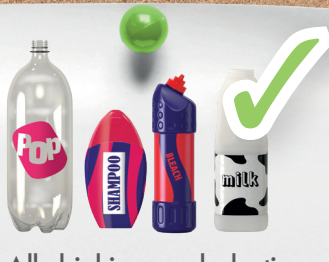
All drinking and plastic bottles, including cleaning product bottles